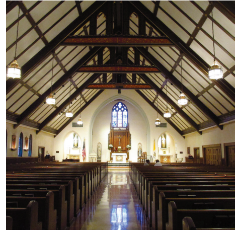
Sanctuary of St. Bridget Church

On September 15th, an old-fashioned Parish Picnic will take place for all ages to join in.