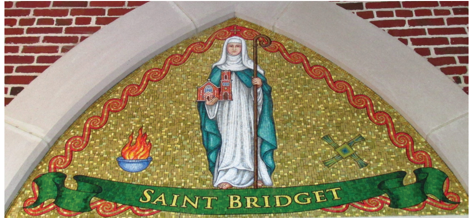
Mosaic of St. Bridget

On May 21, 1950, the Bishop came to dedicate and bless the completed St. Bridget Church at the corner of Three Chopt and York Roads. The original structure was designed by a Philadelphia architect who directed Italian marble to be used for the altar, ambo, statues, and baptismal font. Many top artisans of the