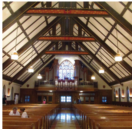
Sanctuary with choir loft and organ

St. Bridget parish will begin their 75th Anniversary celebration on September 7, 2024, with Mass followed by a Casino Night .