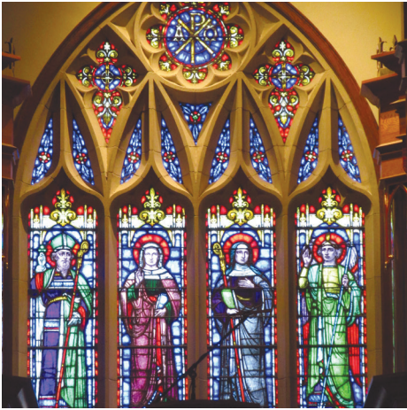
Stained glass of Sts. Michael, Ann, Bridget and Patrick

which, due to the tailor-made fitting of the new organ, allowed the gorgeous stained-glass windows of Sts. Michael, Ann, Bridget, and Patrick to be seen again for the first time since 1975. Now the heavenly tone of the pipe organ is complimented by the visual glory of the stunning stained glass.